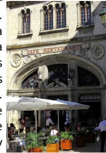
Café Santa Cruz

It will probably take you 30 to 45 minutes to get to Coimbra, find a parking space and walk to the cafe. Parking spots may be more abundant near the river (Ria Mondego). Parking spots may be more abundant near the river (Ria Mondego). Plan to have lunch at Cafe Santa Cruz (Praça 8 de Maio) in Coimbra no later than 13:00. The café is iconic having been serving patrons in the heart of Coimbra since 1923. The local specialty here is the "crúzio", a pastry named after the monks who lived in the monastery of Santa Cruz.