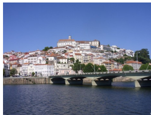
Coimbra—On A Hill Above the Rio Mondego

The site and museum opens at 10:00 am, so you should leave the Quinta dos Três Rios by 8:30. The archaeological site is approximately 16 km southwest of Coimbra. Give yourself at least two hours for your exploration and the museum visit at Conímbriga.