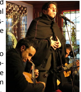
Fado Ao Centro

University Library and Chapel, the Old Cathedral (Igreja da Se Velha), Cloisters and Gardens, and the Museu Machado de Castro.