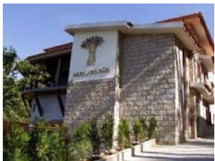
Seia—Museu do Pao

There are two museums in town that may attract your attention. The Bread Museum (located at Quinta Fonte do Marrao) is set in a complex that includes a restaurant and bread shop and has all the information you'll ever need on bread production in Portugal now and in the past. Be sure to ask to see the children's section. The museum restaurant is a good place for a meal that specializes in the local cuisine. The Toy Museum, near the Turismo office, traces the history of Portuguese toys. There's a play room and a workshop where kids