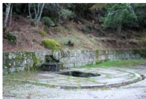
Nascente do Rio Mondego

teiga is the Nascente do Rio Monteginho, the source of the Mondego River. You will find a parking area and picnic tables. Just one kilometer past is a roadside market where you will find well-priced wool blankets, cheeses, meats, sandwiches and cold drinks, and authentic souvenir items.