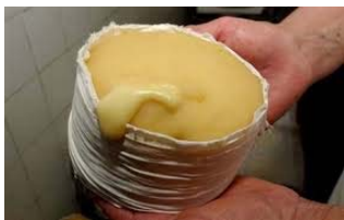
Queijo da Serra

This trip is recommended for people including mature teenagers who appreciate history. Minimal walking is necessary. However, there are many opportunities, especially near Manteigas, to find hiking trails in the highest mountains of Portugal, the Serra da Estrela.